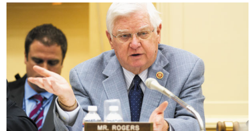
House Appropriations Committee Chairman Hal Rogers

In November, the Association of American Universities (AAU) sent a letter to House and Senate leaders urging them to finish the FY17 appropriations process this year. The letter noted that proposed funding increases for research in the House and Senate appropriations bills, as well as the Senate-proposed restoration of the year-round Pell Grant, would be lost with a year-long CR. The new Congress could still provide the investments mentioned in the letter if it passes FY17 appropriations bills.