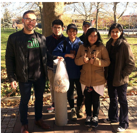
Members of the Student Health Advisory Council

Nearing its one-year anniversary of implementation, Stony Brook's tobacco-free policy, and accompanying campaign titled "An Air of Respect," are already making a positive impact on the campus community.